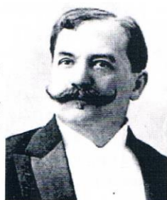
Carl Michael Ziehrer