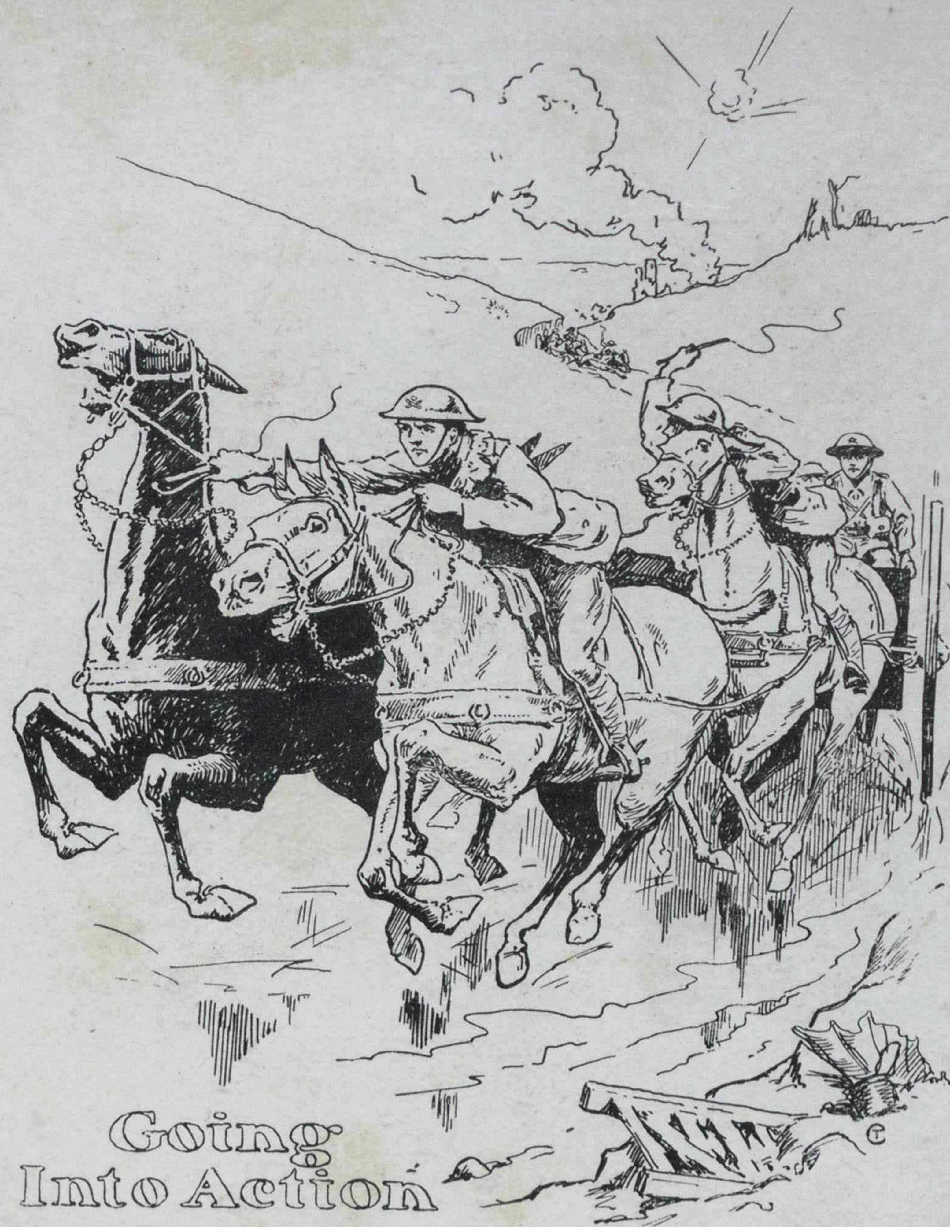
Going Into Action